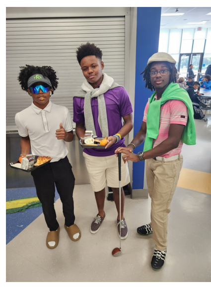
Country vs. Country Club